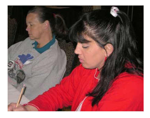
LATM Board Members working at the February meeting in Lafayette