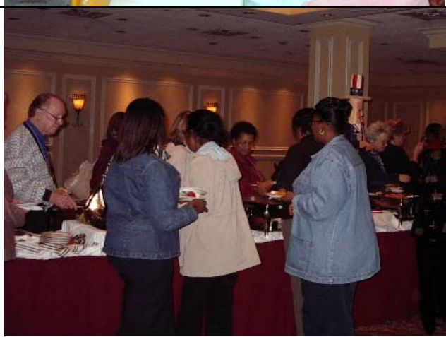
The Exhibit Social was enjoyed by all!!!