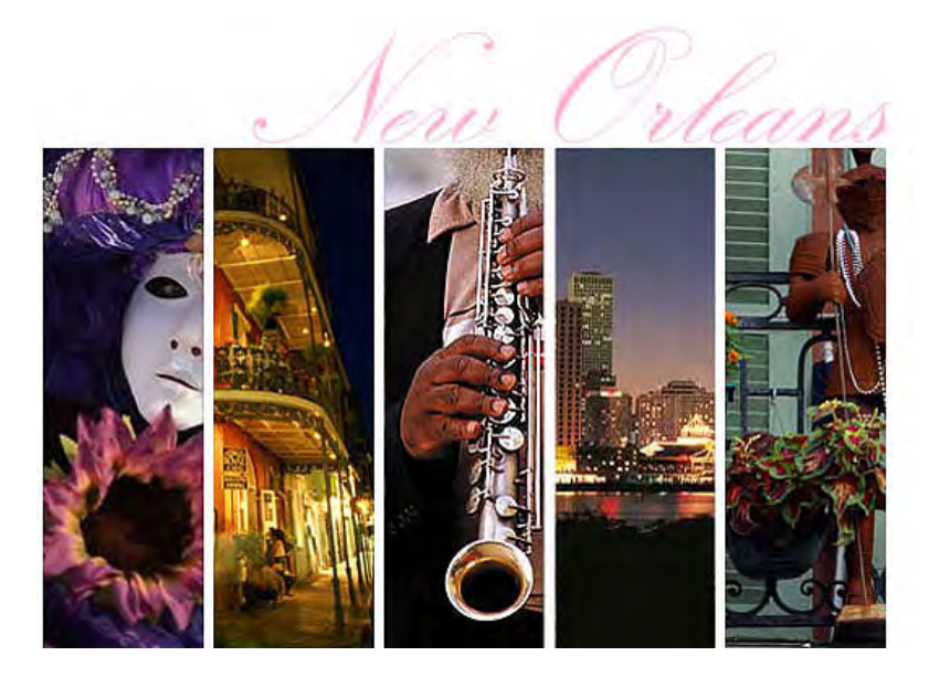
Meet us in New Orleans for the NCTM New Orleans Regional Conference and Exposition October 28-29, 2010